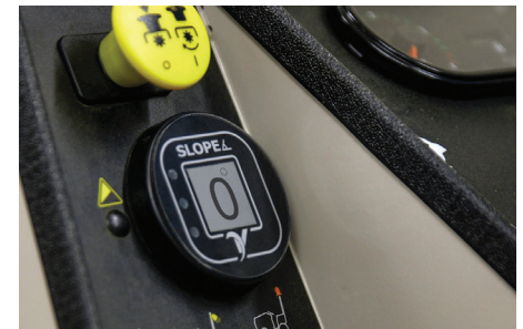
Digital Slope Gauge Recommended for operation on slopes.

*Attachments, accessories, and tire configuration may reduce the 4500 power unit's maximum angle of operation. Refer to applicable operator manuals for maximum angle of operation of equipment.