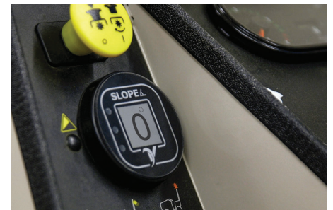
Digital Slope Gauge Recommended for operation on slopes.

*Attachments, accessories, and tire configuration may reduce the 4500 power unit's maximum angle of operation. Refer to applicable operator manuals for maximum angle of operation of equipment.