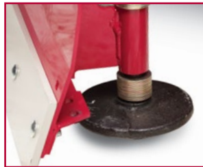
Adjustable cast iron skid shoe discs