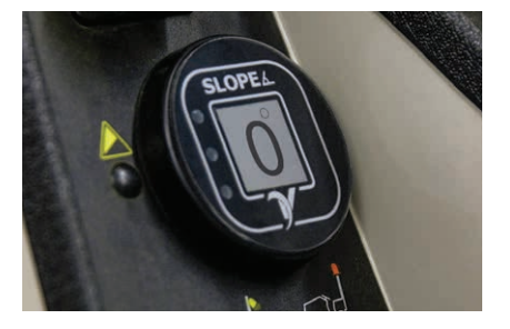
Digital Slope Gauge Recommended for operation on slopes.