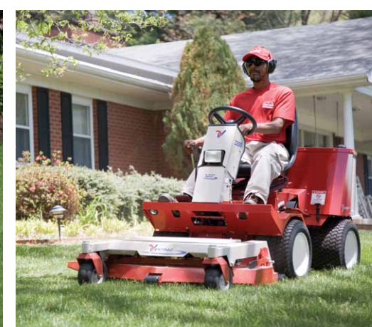
Finish Mowers World-Class Cut

Low center of gravity, all-wheel drive, and weight transfer control help the 3000 series outperform most mowers on hillsides.