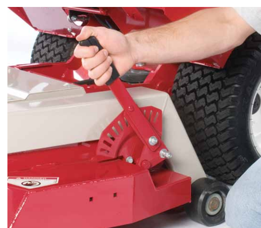
Easy Adjustment Lever Precise Mowing Height

Cleaning the deck and changing blades couldn't be easier with Ventrac's quick flip-up deck design.