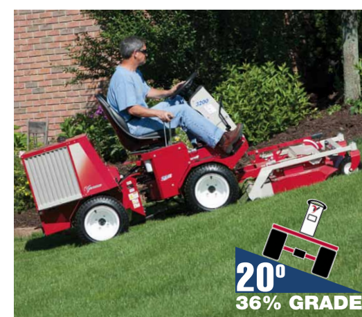
Slope Operation Optimized Handling

All finish mowers have an easy adjustment lever to quickly set height increments.