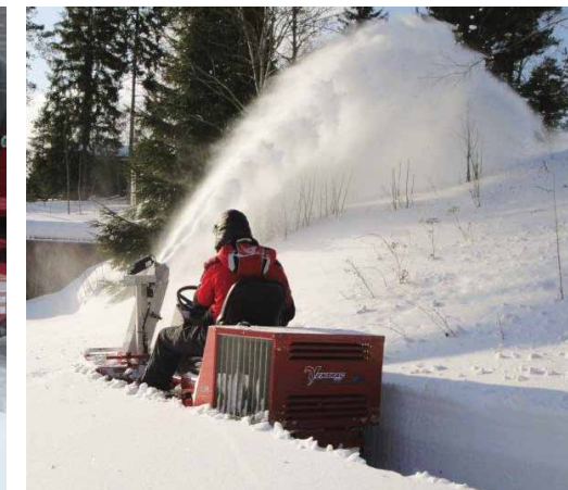
Snow Blower Move Winter's Worst

The Ventrac V-Blade cuts through snow, separating and pushing it to both sides. Both wings adjust hydraulically for ease in controlling the direction of the snow.