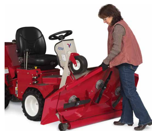
Flip-Up Deck Easy Service

Floating deck with full-length rear roller stripes the lawn for the finish of a professional baseball field.