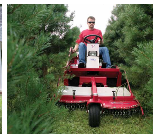
Field Mower Tough and Rugged

Professional mowing contractors around the world trust Ventrac for the highest quality cut.