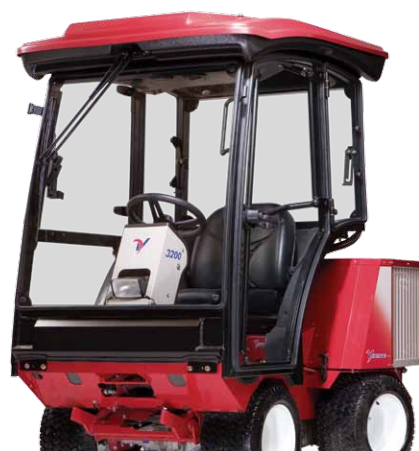
Enclosed Cab Warm and Dry

The 3000 is the perfect size for maneuvering quickly on sidewalks, yet powerful enough to move heavy snowfalls.