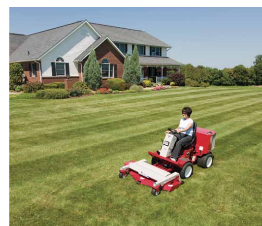
Full Rear Roller Stand-Out Stripes

Ventrac mowers are the premier choice for the commercial mowing industry. Get a professional striping finish with the highest quality cut.