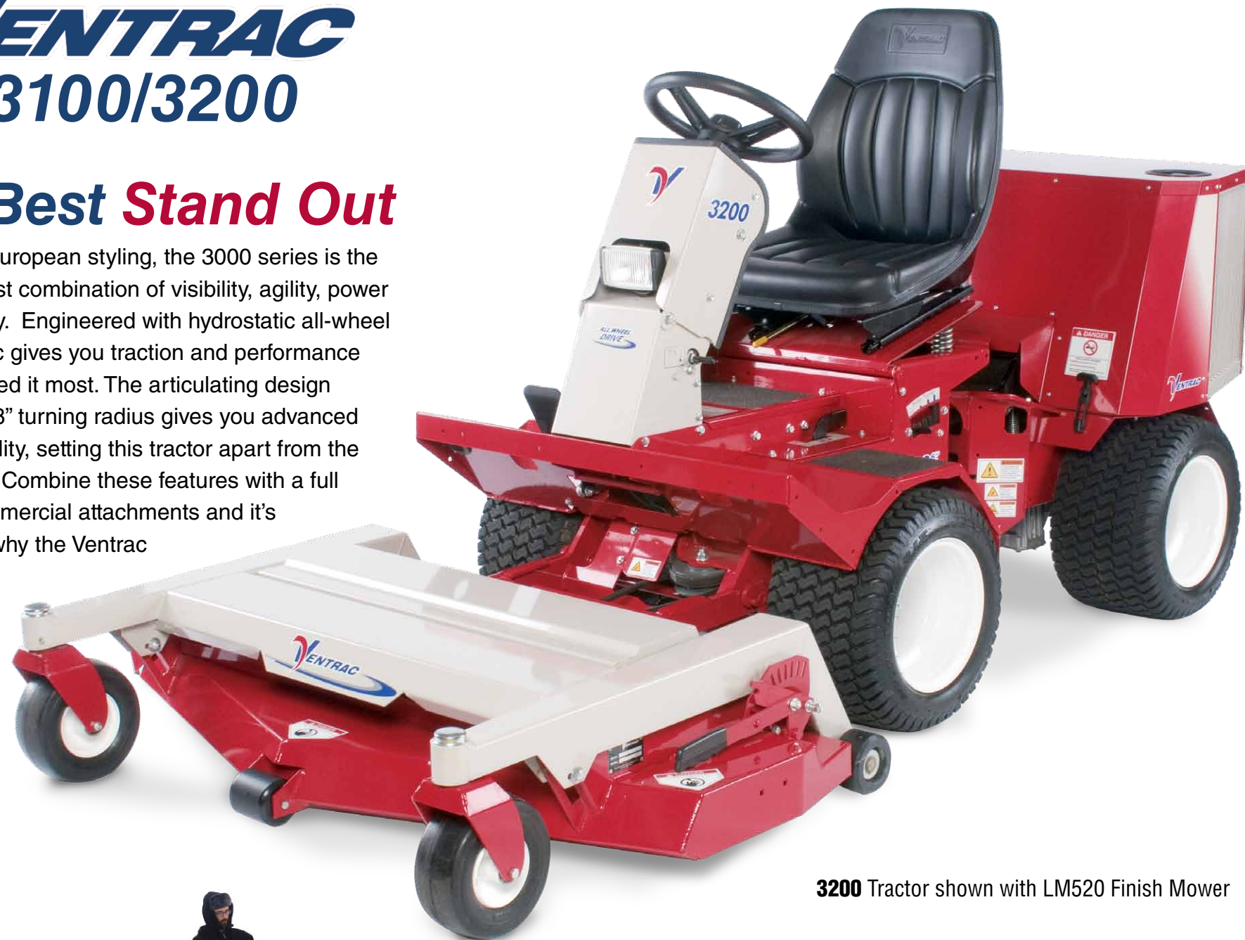
3200 Tractor shown with LM520 Finish Mower

Inspired by European styling, the 3000 series is the industry's best combination of visibility, agility, power and versatility. Engineered with hydrostatic all-wheel drive, Ventrac gives you traction and performance when you need it most. The articulating design and a tight 28" turning radius gives you advanced maneuverability, setting this tractor apart from the competition. Combine these features with a full range of commercial attachments and it's easy to see why the Ventrac 3000 series stands out.