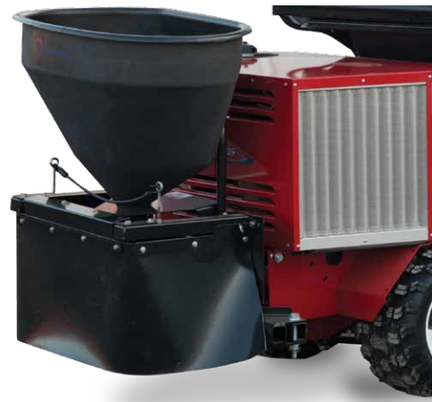
Salt Spreader One Pass Ice Control

A rear-mounted spreader allows you to spread de-icing material as you are plowing the snow, saving time and energy.