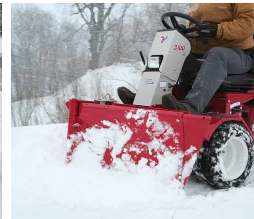
V-Blade Pushing Power

The powerful rotary broom is an efficient solution for light to medium snowfalls and can also handle more demanding tasks. Quickly clear a path through snow leaving a clear surface.