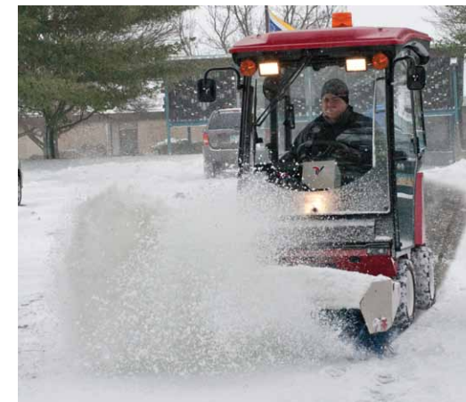
Power Broom Clean Sweep

A rear-mounted spreader allows you to spread de-icing material as you are plowing the snow, saving time and energy.