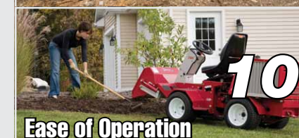
Ease of Operation