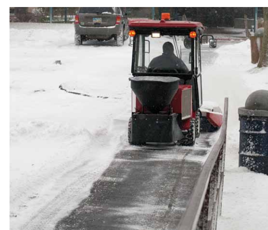
Compact Power Sidewalk Snow

The 3000 is the perfect size for maneuvering quickly on sidewalks, yet powerful enough to move heavy snowfalls.